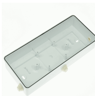
ACC. HOUSING IP44 DIANA FLAT WHITE