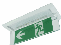
ACC. PANEL REC. DIANA FLAT WHITE