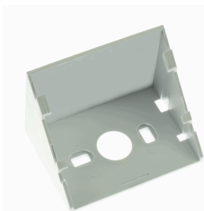
ACC. SLOPE 47° FLAT WHITE