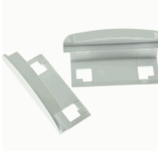
ACC. PROT. IK10 FLAT WHITE