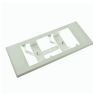
ACC. FRAME REC. DIANA/XENA UNIVERSAL - WHITE