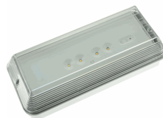
ACC. HOUSING IP66 DIANA FLAT WHITE