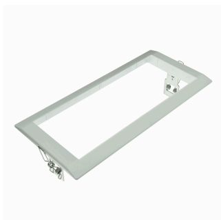
ACC. REC. DIANA FLAT WHITE