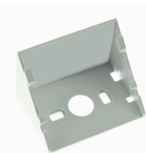
ACC. SLOPE 47° FLAT WHITE