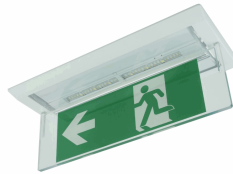
ACC. PANEL REC. DIANA FLAT WHITE CEILING