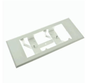
ACC. FRAME REC. DIANA/XENA WHITE UNIVERSAL