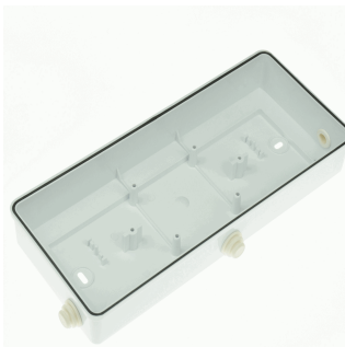
ACC. HOUSING IP44 DIANA FLAT WHITE