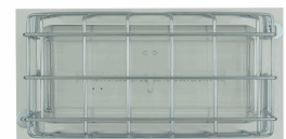
ACC. PROTEC. GRILLE FLAT/VENUS