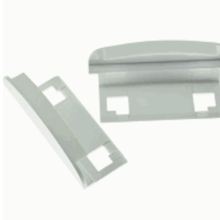
ACC. PROT. IK10 FLAT WHITE