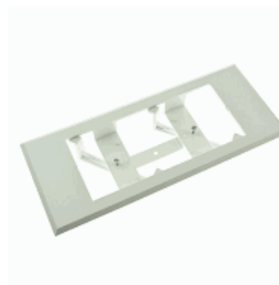
ACC. FRAME REC. DIANA/XENA WHITE UNIVERSAL