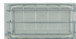
ACC. PROTEC. GRILLE FLAT/VENUS