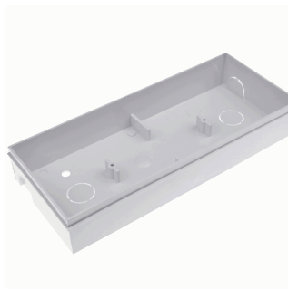
ACC. SEMI-REC. DIANA FLAT WHITE WALL