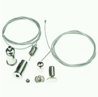
ACC. SUSPENSION KONS HARENA