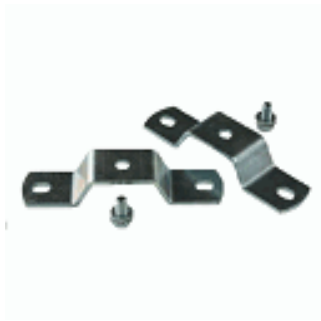
ACC. FIXATION FLANGE SATURNO