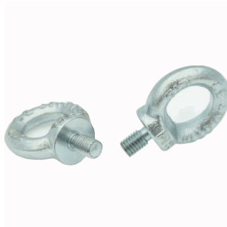
RING BOLT FOR PENDANT MOUNTING