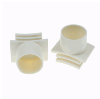
ACC. INPUT FLEX. SPAZIO LUZ WHITE SURFACE TUBE