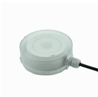
ACC. HOUSING IP65 SPAZIO LUZ WHITE