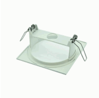
ACC. REC. SPAZIO LUZ WHITE CEILING SQUARE