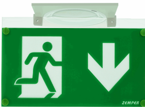
ACC. REC. PANEL SPAZIO LUZ WHITE CEILING SQUARE