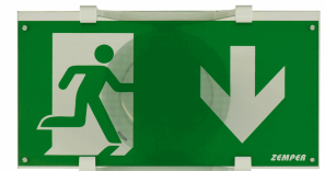
ACC. PANEL SURF. SPAZIO LUZ WHITE WALL