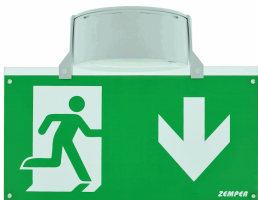
ACC. PANEL SURF. SPAZIO LUZ WHITE CEILING