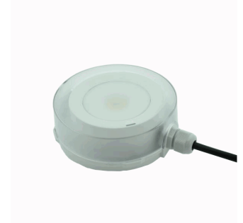
ACC. HOUSING IP65 SPAZIO LUZ WHITE