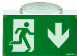
ACC. PANEL REC. SPAZIO LUZ WHITE CEILING ROUND