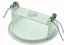
ACC. REC. SPAZIO LUZ WHITE CEILING ROUND