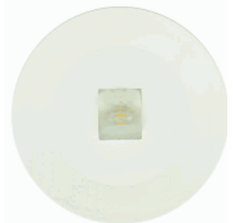
ACC. ASIMET. LENS SPAZIO LUZ WHITE