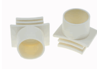
ACC. INPUT FLEX. SPAZIO LUZ WHITE SURFACE TUBE