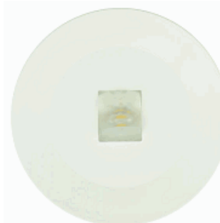
ACC. ASIMET. LENS SPAZIO LUZ WHITE