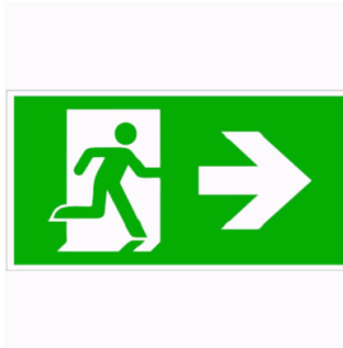
ACC. PICTO. SATURNO RIGHT ARROW