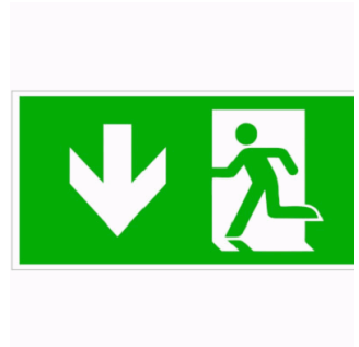
ACC. PICTO. SATURNO DOWN ARROW