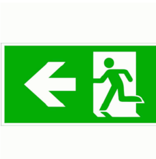
ACC. PICTO. SATURNO LEFT ARROW