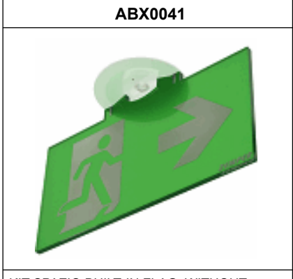
KIT SPAZIO BUILT-IN FLAG WITHOUT SERIGRAPHING