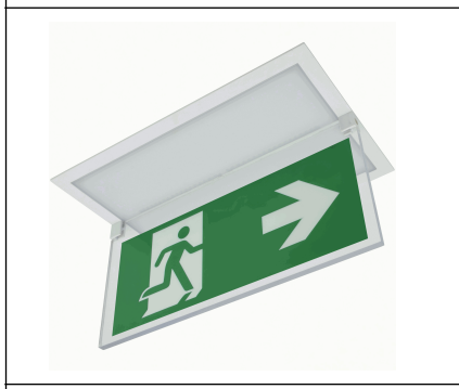
ACC. PANEL REC. TOLEDO IP44 WHITE SERIG. RIGHT/LEFT ARROW