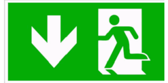
ACC. PICTO. SATURNO DOWN ARROW