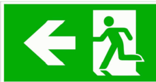
ACC. PICTO. SATURNO LEFT ARROW