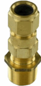
ACC. CABLE GLANDS SATURNO METALLIC