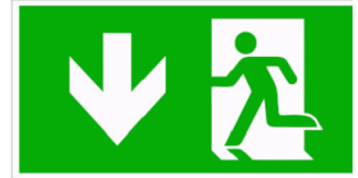
ACC. PICTO. SATURNO DOWN ARROW