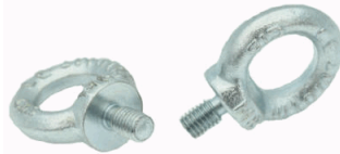
RING BOLT FOR PENDANT MOUNTING