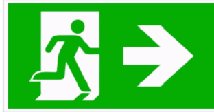
ACC. PICTO. SATURNO RIGHT ARROW