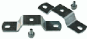
ACC. FLANGE FOR SURF. SATURNO CEILING MOUNTING