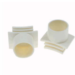
ACC. INPUT FLEX. SPAZIO LUZ WHITE SURFACE TUBE