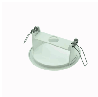
ACC. REC. SPAZIO LUZ WHITE CEILING ROUND