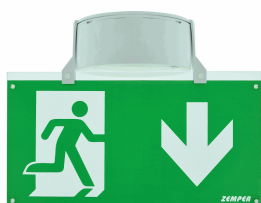
ACC. PANEL SURF. SPAZIO LUZ WHITE CEILING