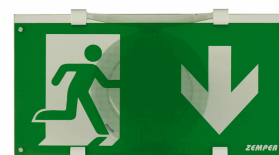
ACC. PANEL SURF. SPAZIO LUZ WHITE WALL