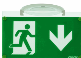
ACC. PANEL REC. SPAZIO LUZ WHITE CEILING ROUND