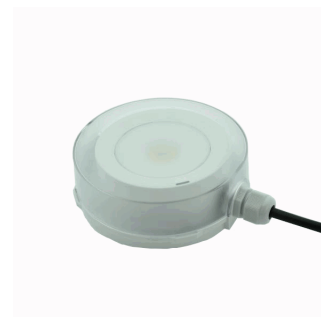
ACC. HOUSING IP65 SPAZIO LUZ WHITE