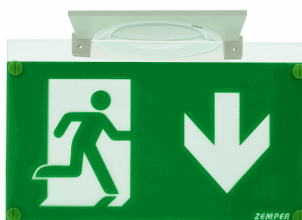
ACC. REC. PANEL SPAZIO LUZ WHITE CEILING SQUARE