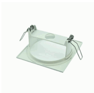
ACC. REC. SPAZIO LUZ WHITE CEILING SQUARE