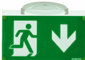
ACC. PANEL REC. SPAZIO LUZ WHITE