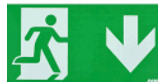
ACC. PICTO. DIANA FLAT PERSON + DOWN ARROW