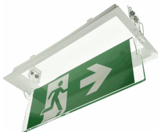
ACC. PANEL REC. XENA FLAT WHITE WITHOUT SERIG.