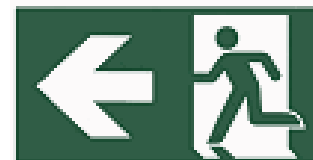
ACC. PICTO. DIANA FLAT PERSON + LEFT ARROW