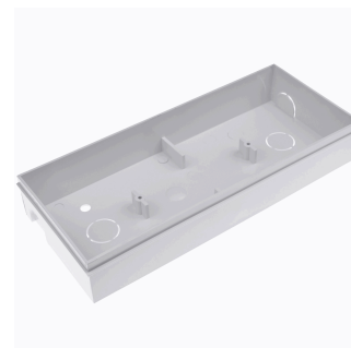
ACC. SEMI-REC. DIANA FLAT WHITE WALL