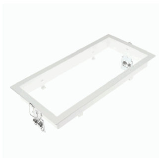
ACC. REC. XENA FLAT WHITE CEILING