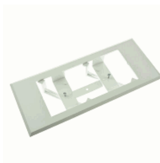
ACC. FRAME REC. DIANA/XENA WHITE UNIVERSAL