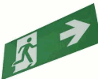
ACC. PICTO. DIANA FLAT PERSON + RIGHT ARROW